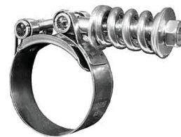
20mm Band Width 430 SS Band with Alu Zinc Screw