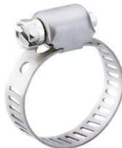
7.9mm Band Width

6 - 11mm 11-20mm 13-23mm 14-27mm 17-32mm 24-38mm 30-44mm 37-51mm 43-57mm 49-64mm