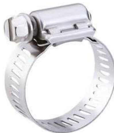
12.7mm Band Width

11-20mm 13-23mm 14-27mm 17-32mm 21-38mm 21-44mm 27-51mm 33-57mm 40-64mm