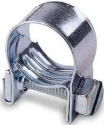
W4 304 SS Band & Screw