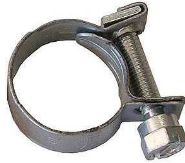
W1 Alu Zinc Band & Screw